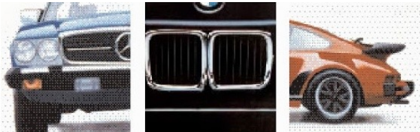
Hubbard's German Auto, Inc 236 West Grant, Eureka, CA 95501 · 707 443-4496